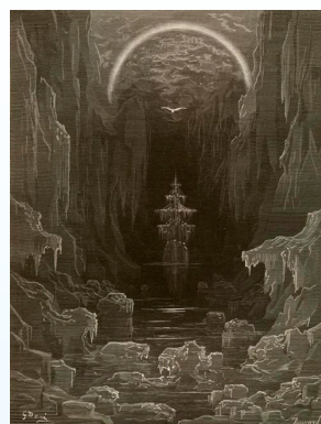
Gustave Dore's bleak Antarctic illustration for The Rime of the Ancient Mariner (1878)

Wilson also edited The Polar Times, which featured cartoon drawings, poems, songs and articles, both serious and humorous, allowing the 'amateur artists' of the expedition to express themselves.