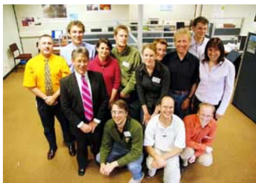
GeoHealth Laboratory team

The Laboratory is located in a dedicated room situated adjacent to the Department of Geography. The Laboratory room is fitted out with three partitioned workstations, bench space for a further five workstations and eight reading carrels. In addition there is a large table and white board. The laboratory is locked and has passcode protected entry. The Laboratory layout was carefully considered to provide a conducive working and research environment with extra capacity beyond initial requirements to allow for growth.